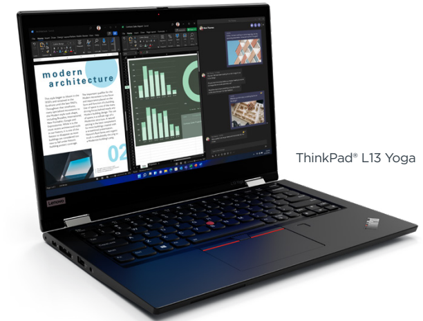
ThinkPad® L13 Yoga

Unlock the power of creativity and collaboration