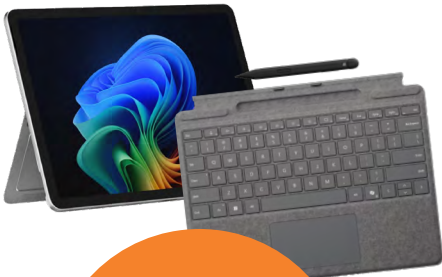
Surface Pro 11 12” Platinum 12 Inch Keyboard and Slim Pen Extended Hardware Service - 3 Years

Snapdragon X Plus (10 Core) Qualcomm Hexagon 45 TOPS 16GB RAM