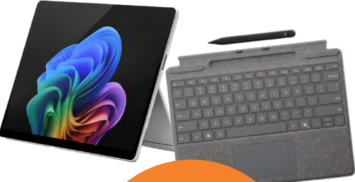
Surface Pro 11 13” Platinum Keyboard and Slim Pen 2 3 Year Warranty

Core Ultra i5 Intel AI Boost with 40 TOPS 16GB RAM