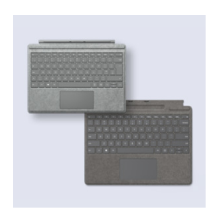
Signature Type Cover

Compact, adjustable, easy-to-use device protection